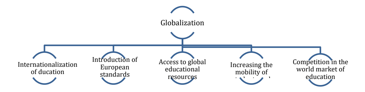
Figure 2 – Main positive ways globalization impacts higher education

Thus, the Ukrainian higher education system has been able to adapt to global trends in some aspects, despite the current challenges posed by the Russian threat. Figure 2 outlines the main ways globalization impacts Ukrainian higher education.